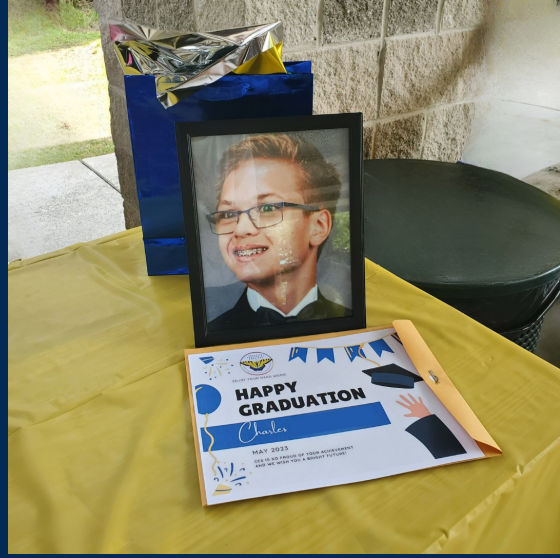
Charles , who aspires to join the military